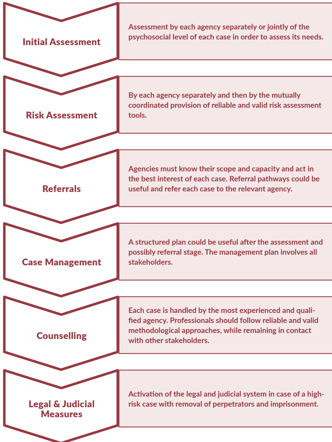
Figure 3: Processes of coordinated response

The MOVE Multi-agency Collaboration Model follows a sequence of steps (Figure 3) to ensure a stable structure for services provision, and professionals' engagement at any each stage of intervention and collaboration. The process incorporates common/similar risk assessment procedures, and common/similar tools.